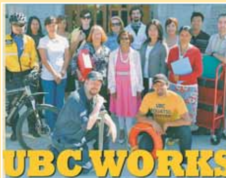
□ LOCAL PRESENCE A new on-campus ad campaign from the three CUPE locals at UBC seeks to introduce our members to a new generation of students, show the diversity of the membership, and educate students about the value of their work.

CUPE has identified a number of priority areas for members, including stable funding and improvements for the Public Education Benefits Trust, job security, and improved wages and benefits. CUPE also made a significant presentation on recognition and respect for Education Assistants and the need for more hours to properly serve students.