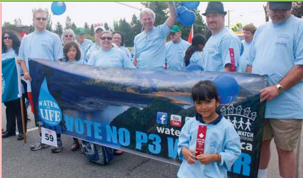
□ WAVE OF SUPPORT Canada Day in Abbotsford was a sea of blue as members of Water Watch Mission-Abbotsford took to the streets.

Want to help your union’s efforts to defend public services? You still have until October 21 to register for CUPE BC’s Anti-Privatization conference (November 22 – 24), to be held at the Coast Plaza Hotel and Suites in Vancouver.