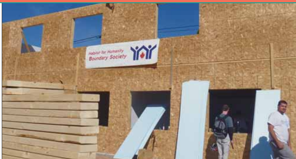
□ LENDING A HAND Members of CUPE 4728 lent their skills to a housing project sponsored by Habitat for Humanity.