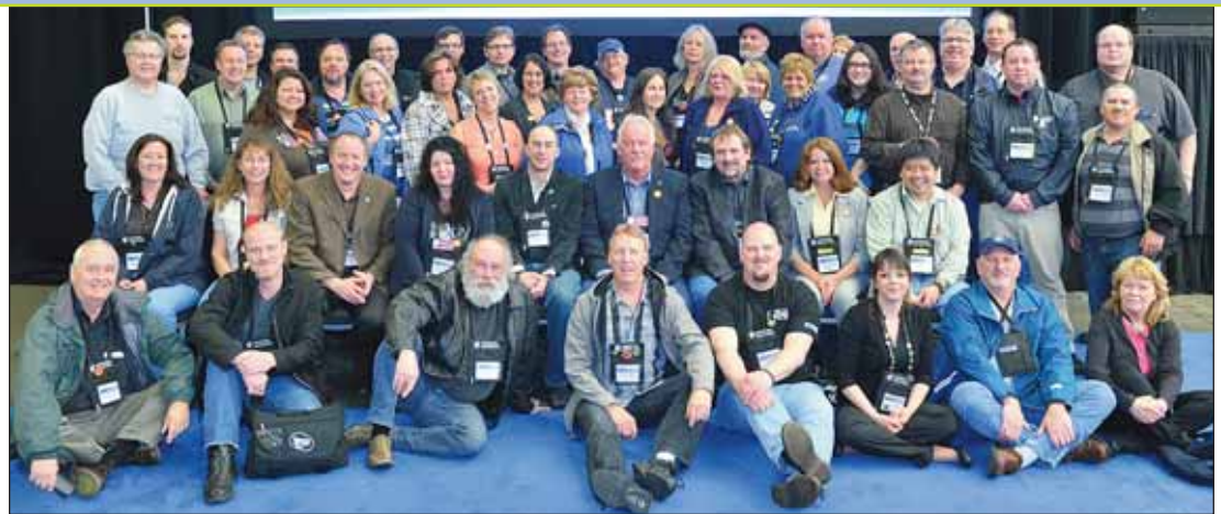
□ LEFT COAST SOLIDARITY CUPE delegates from B.C. assemble at the Canadian Labour Congress' bi-annual convention, held this past May in Vancouver. The convention, billed as "Good Jobs. Better Lives—Unions make a difference," focused on building a strong, sustainable national economy that creates family supporting jobs and ensures no one is left behind.

PORT ALBERNI | CUPE 727, representing workers in the Alberni School District on Vancouver Island, welcomed