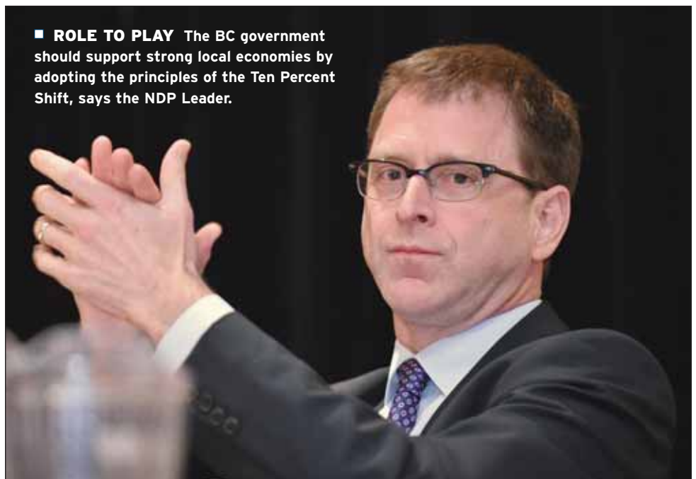
■ ROLE TO PLAY The BC government should support strong local economies by adopting the principles of the Ten Percent Shift, says the NDP Leader.

A longer version of this article is posted on www.cupe.bc.ca .