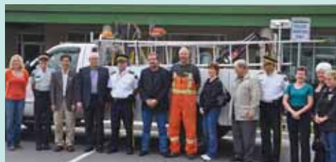
□ TEAM EFFORT "City Watch" combines the resources of city hall, police and CUPE.

CUPE BC's City Watch program continues to grow, with new participating municipalities Surrey and Pitt Meadows the latest to join. Nearly 30 B.C. communities are now participating in CUPE's popular program, which brings the eyes and ears of civic workers to fight and