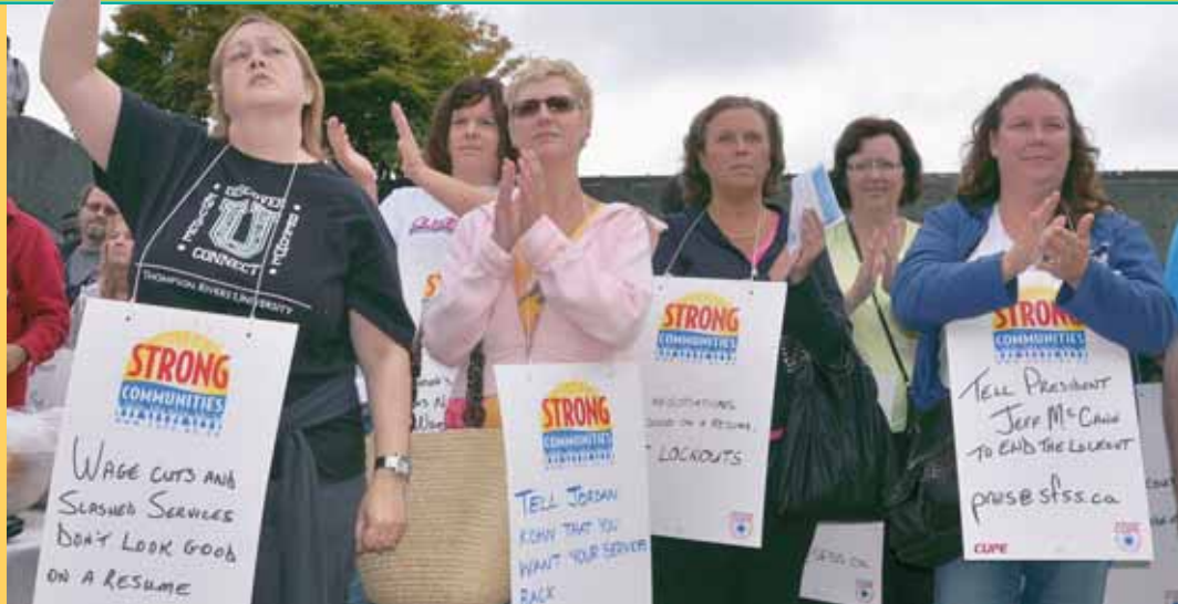
□ A MATTER OF RESPECT Hundreds of people showed up at SFU's main campus in Burnaby on September 13 to support locked out CUPE members whose employer wants to cut wages by up to 40 per cent.

"Premier Clark's announcement of $8.9 million in additional funding does very little to address continuing needs when the shortfall is $70 million – $85 million if we were to maintain 2005 levels."